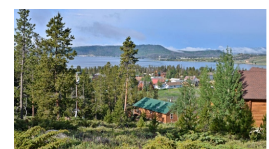
Home site on a hill overlooking Lake Granby. Fine views to National Forest lands to the west where one may have been to treeline by snowmobile! $68,000