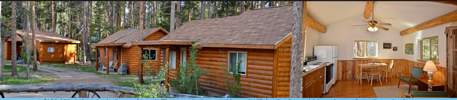
$120,000 each ~ in the heart of town! Three one bedroom cabins and efficiencies from which to choose. Just minutes by foot from 3 lakeside parks, fishing, boardwalk shops, theater and restaurants. Large central play and BBQ area plus big bonfire circle.