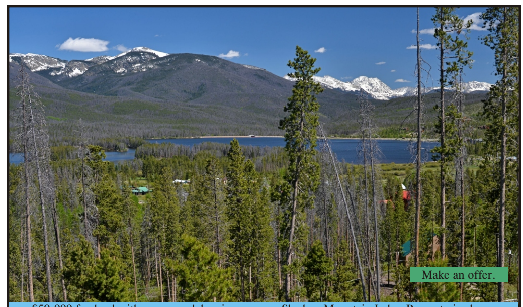
$59,000 for land with awesome lake views across Shadow Mountain Lake. Property is along a ridge with views deep into Rocky Mountain National Park (to the east). To the west, one can gaze across a valley to National Forest land. Nice level area on top for your home and driveway.