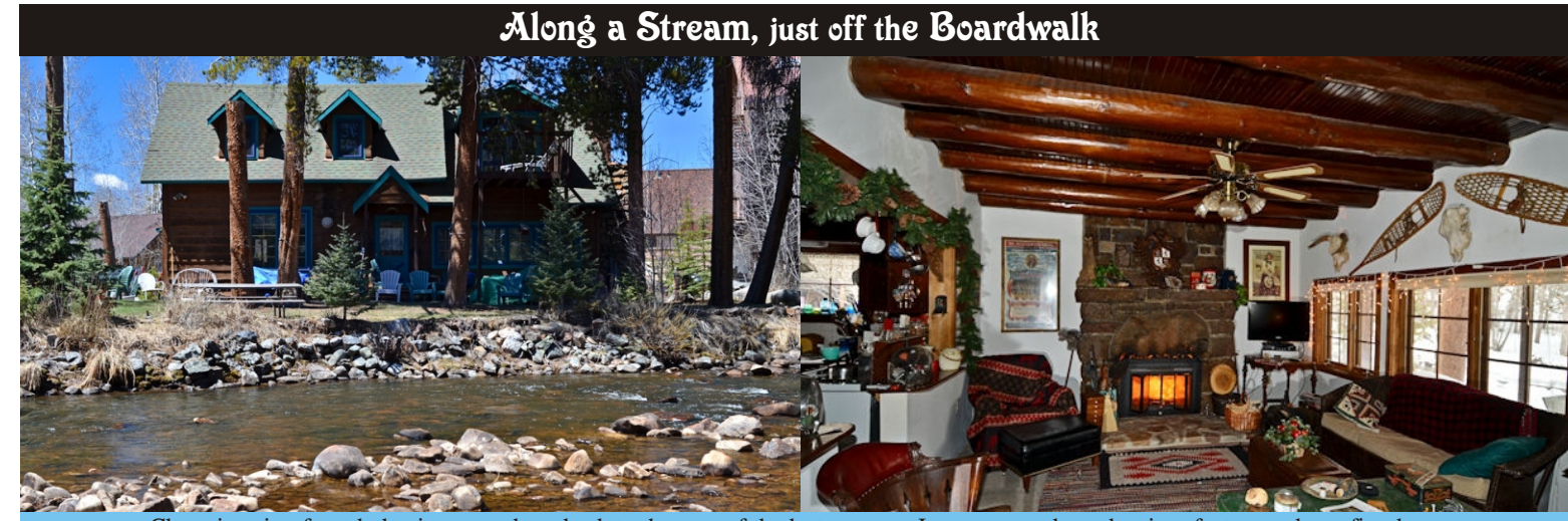
Charming riverfront lodge in town, dates back to the turn of the last century. Large room along the river features a huge fireplace. Terrific location two blocks from Grand Lake's beach. Bedrooms are on the upper level. $650,000