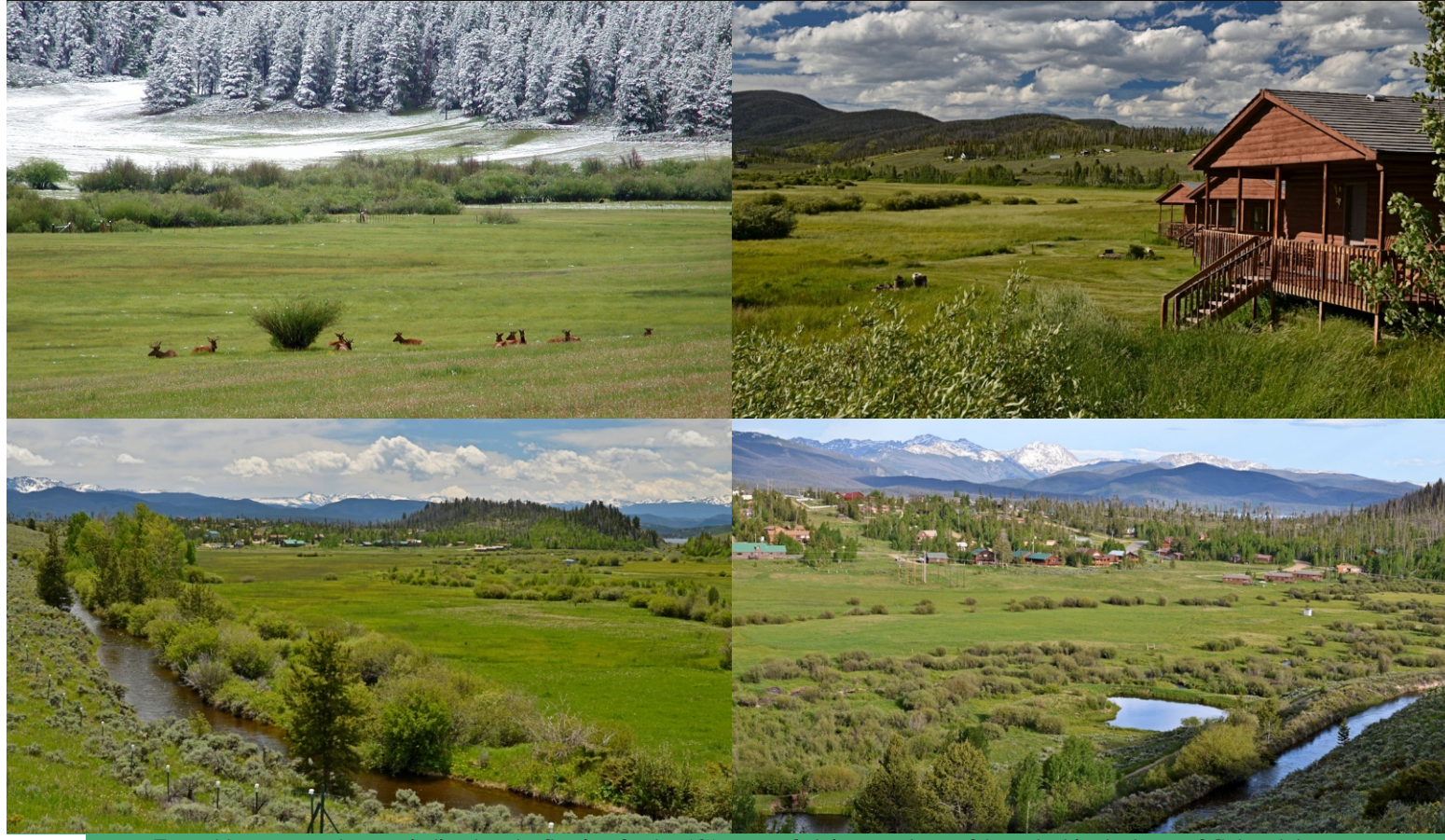
Emerald green meadows, winding brooks flowing freely, 131 acres of alpine meadow safely tucked in the heart of Colorado! A precious pocket of land that can impart a rancher's wisdom of what a large spread of land can do, coupled with the rhythms of a large unspoiled region surrounded by mountains. The property comes with a comfortable two bedroom home for your family plus guest cabins for paying guests. Rentals are already in place. Create a Dude Ranch! Offer a stable and a place to ride for people who own horses, llamas, ponies ... The whole package with the 131 acres, 3 cabins and water rights is only $988,000