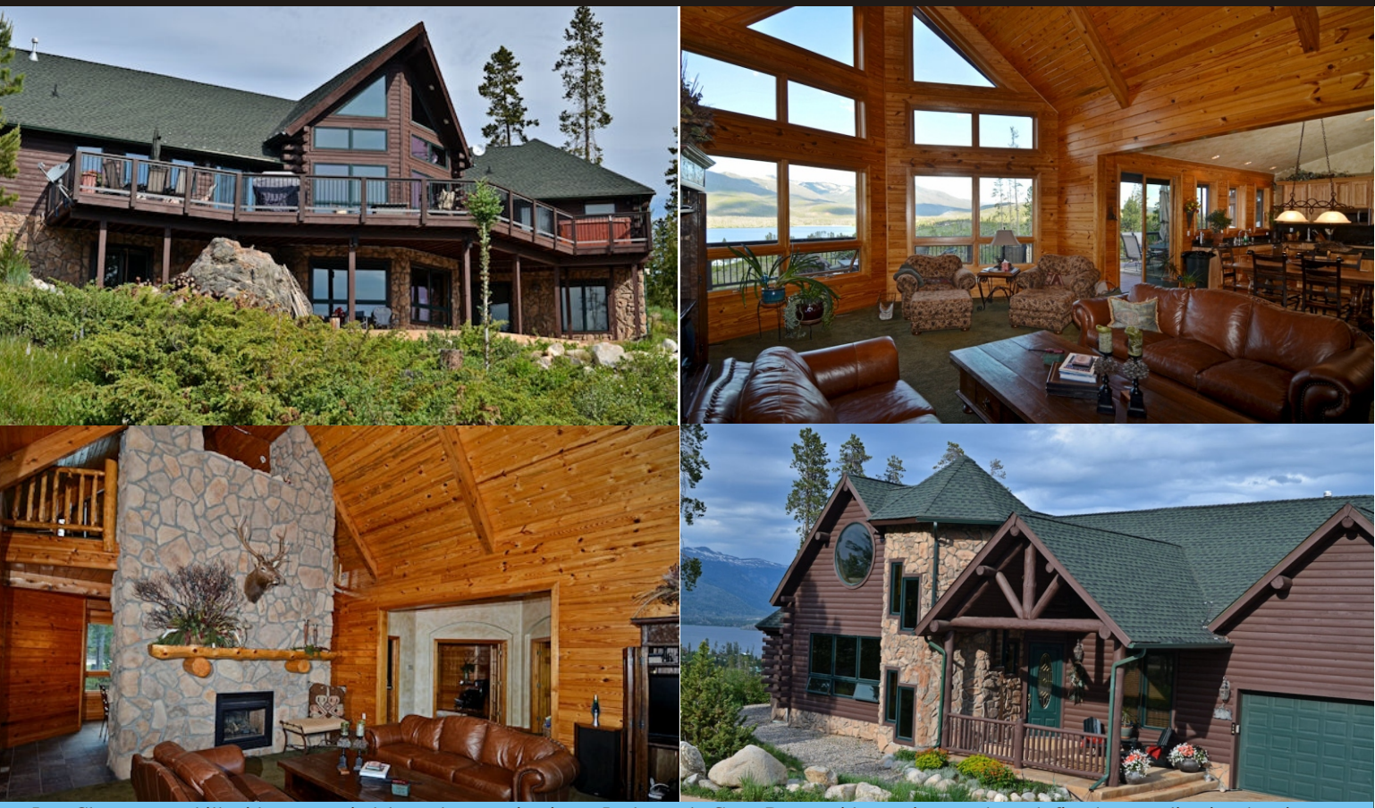
Log Chateau on a hill with panoramic lake and mountain views. Lodge style Great Room with massive see-through fireplace sending its glow into the living and dining areas. Large recreation room on walkout lower level with wide views and an adjoining media room. Luxurious master suite. Versatile floor plan for accommodating guests and storing seasonal items. Expansive deck for dining, relaxing .. hot tubbing ... Three-quarter acre of land close to lakeside parks, boat launches and trails to the sky. Over 5000 sq. ft. plus garages and expansive deck. $995,000