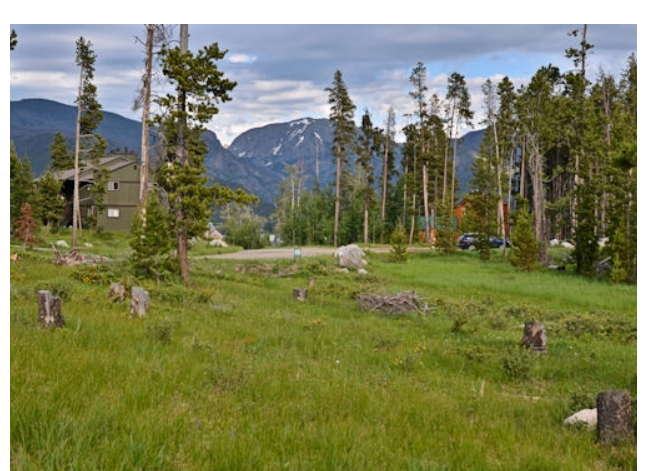
Level acre on the high ridge just west of town towards Golf Course Road. Property extends from one road to another with fine views towards Mount Baldy. $89,900