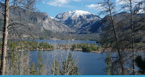
3 of an acre with magnificent views of Grand ake, Shadow Mountain Lake and Mount Baldy Subdivided into three sites. $275,000 for all