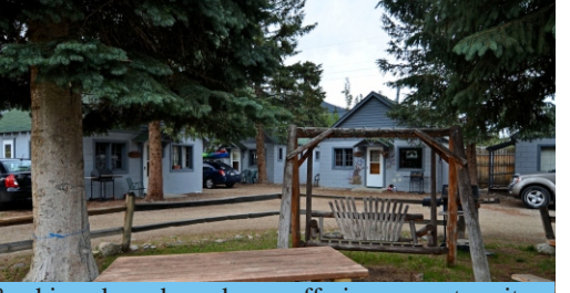
8 cabins plus a large home offering separate suites. Each cabin has an inviting living room, kitchenette and a private bedroom. $899,000