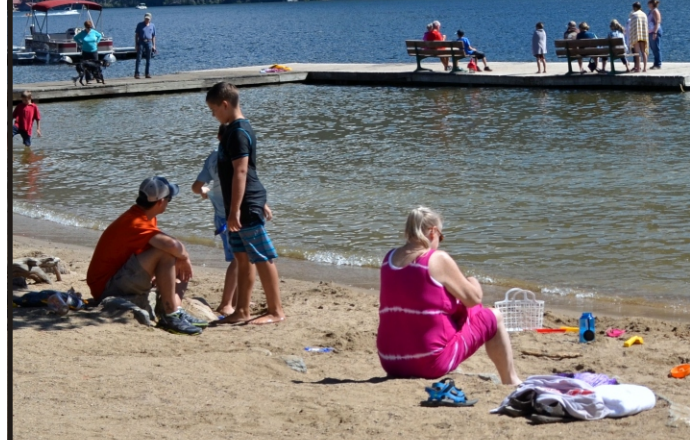
visit us near the east end of the Boardwalk in www.MountainLake.com