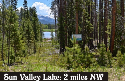
Drive through part of Rocky Mtn. Nat'l Park to reach these two acre sites near the National Forest trails. ATV and snowmobile from your land. $120,000 to $125,000