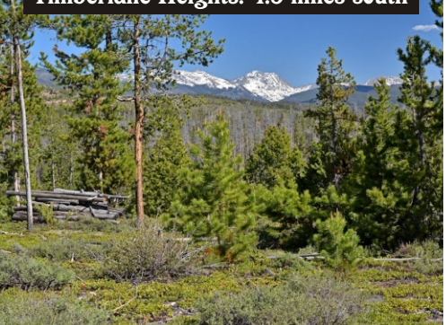
Level home site with views to the Continental Divide. $29,500. Short family walk from the fishing canal. page 11