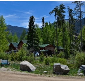
$119,900 for Corner site 100 x100 feet, just off the boardwalk. Commercial transitional zoning