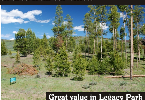
Acreage within a 1800 Acre Ranch: 5<sup>1</sup>/<sub>2</sub> acres bordering a huge meadow with a summer stream. Ready to build on with a well and driveway already in. East of Granby. $115,000