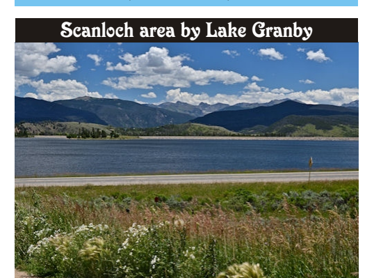
$59,900: wide open views across Lake Granby's Rainbow Bay to the Indian Peaks and Abe Lincoln in repose along the Continental Divide. Land has a blend of sagebrush, pine and wild flowers (in the summer). It is within sight of a boat launch and excellent fishing.