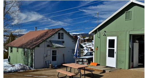
Formerly a convenience store near Lake Granby and a National Forest access road. Large detached garage and storage shed. $379,000