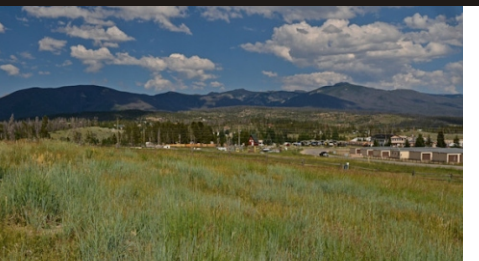
$24,000 and up for land with lake & mountain views. Underground utilities are in: natural gas, electricity, cable television & community sewer. Drill a well for water.