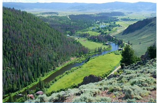
Over 4 Acres overlooking the Colorado River, Lake Granby and the Continental Divide. All 32 lots for $299,000 or $139,000 for 17 lots